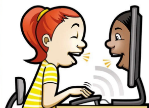
A Parent's Guide to Social Media