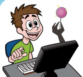
A Parent's Guide to Online Grooming